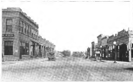
MAIN STREET, NORTH, BUFFALO CENTER